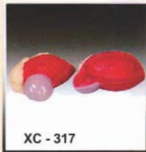
XC - 317

Shows the structure of placenta and the relation between placenta and umbilical cord. 7 positions are displayed